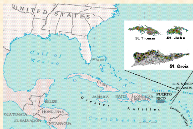
Map of U.S. Virgin Islands which include varied coastal and marine habitats

The U.S. Virgin Islands have some of the most spectacular terrestrial and marine resources in the United States and a long history of environmental and cultural education and outreach programs. No formal mechanism linking the numerous professionals working in environmental and cultural outreach and education existed. VINE was created in August 2004, as a tool to address this lack of organized coordination.