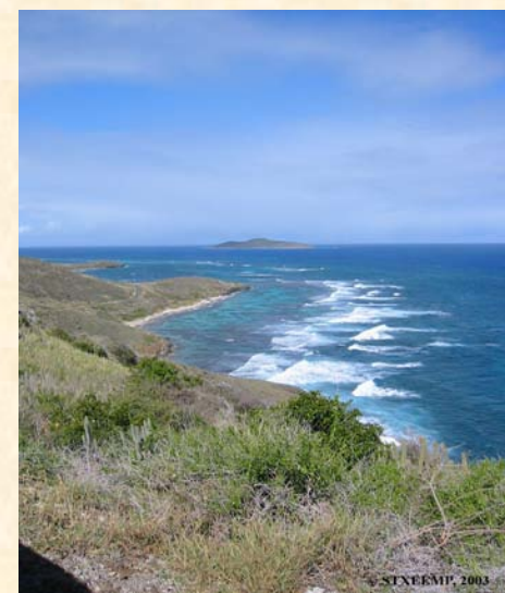
View of coastline-East End of St. Croix