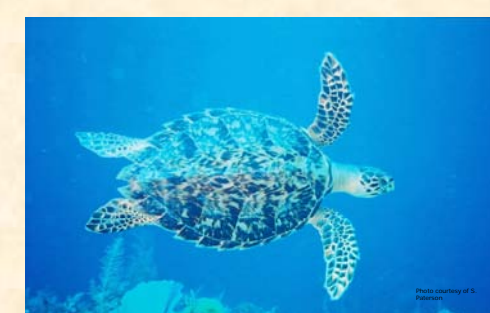
Hawksbill turtle ( Eretmochelys imbricata )