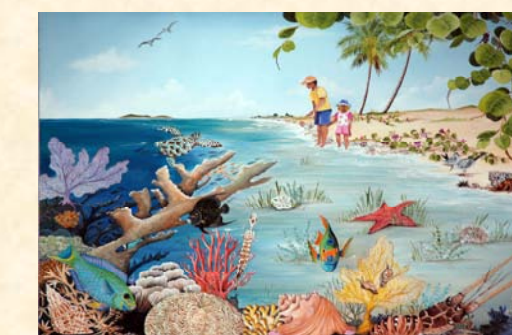
VINE "Leave Paradise in its place" public awareness campaign developed for CFMC