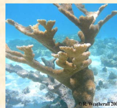
Elkhorn coral ( Acropora palmata ), St. Croix

Stakeholders: Organizations, individuals and the private sector who have an interest in environmental stewardship of the Virgin Islands.