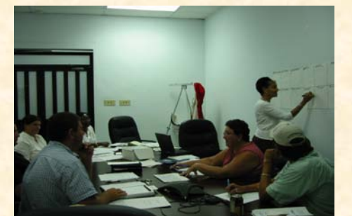
VINE members planning during a monthly meeting

VINE has members from 24 agencies that represent nearly all who are actively involved with the territory's environmental and cultural resources. Membership includes representatives from local and federal governmental agencies, non-governmental organizations (NGOs), private industry, academia and interested stakeholders.