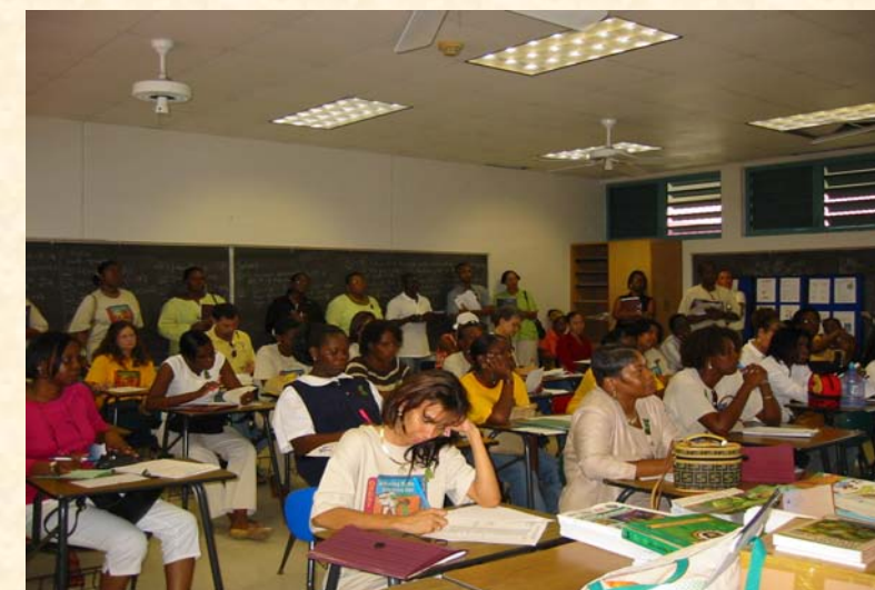
Public school teachers participating in VINE presentation, St. Croix