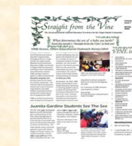
VINE quarterly newsletter