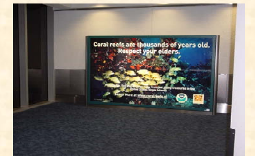
Duratrans at Miami International Airport VICCC "Coral Conservation" campaign funded by NOAA